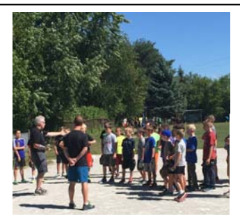
Our 3 pitch teams are in 'full swing.'

Don't forget... Monday, September 26 th is a PA day. No school for students.